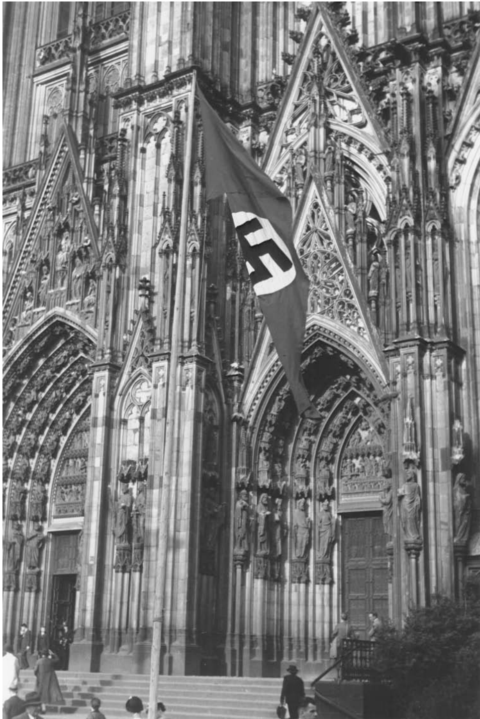
Figure I.3. Catholic Cathedral of Cologne, 1937.